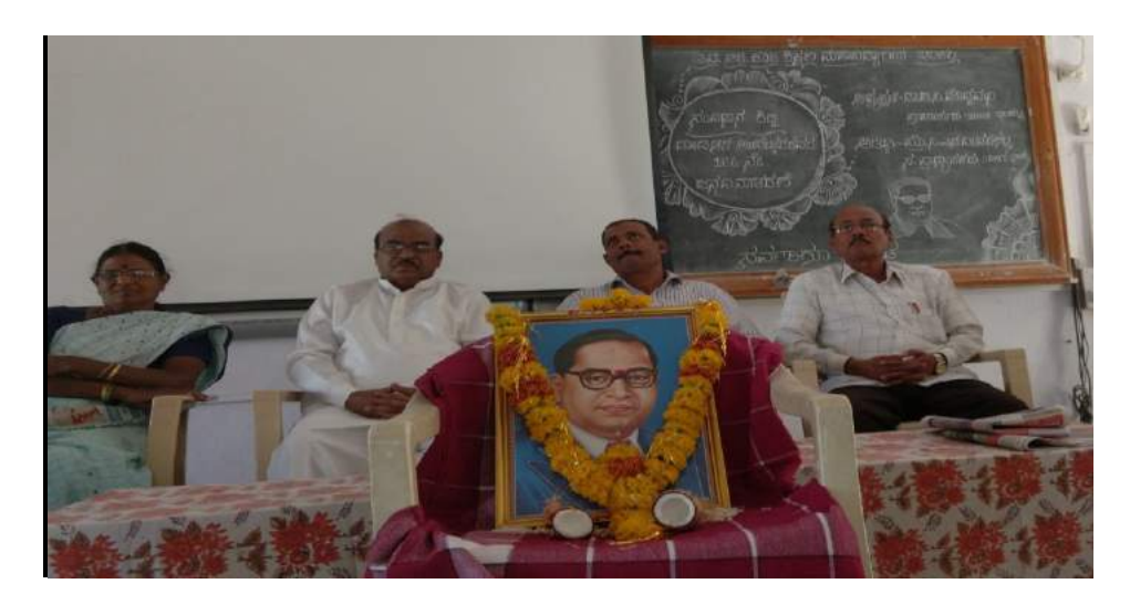
Shri Vijaymahantesh VidyaVardhak Sangh's